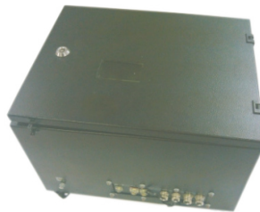
Radio communication control panel ПУР-01